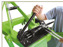
Kit Press (Optional)

The Triller is the first implement of the market that in a single operation performs 3 works: